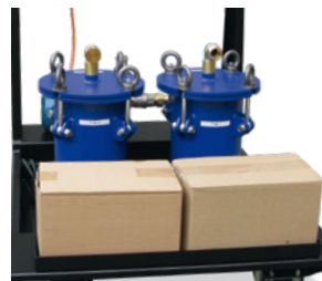
Refills, 2 units